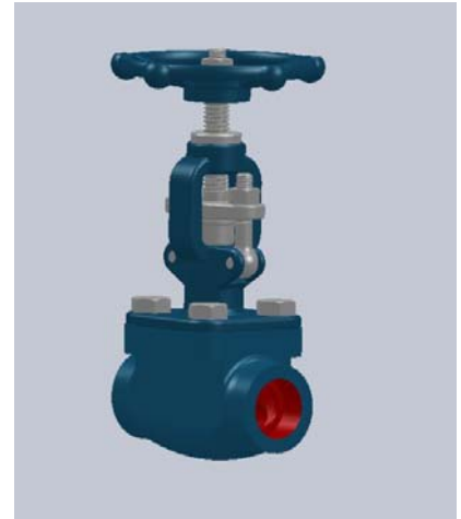
FIG : 106